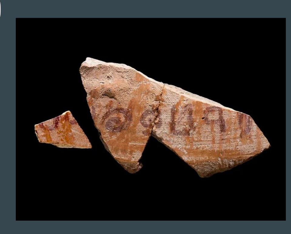
A pottery fragment found in Israel with the inscription Jerubbaal